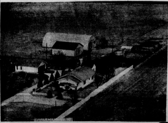
Picture No. 6 in the series of Mystery Farm pictures being printed in the Reporter. The series of pictures are sponsored by 10 aggressive

local merchants. Last week's picture proved to be a popular one, and quite a few readers correctly identified the photo. We urge the owner of this