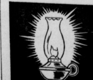
Coal oil lamps followed the discovery of oil in Titus County, Pennsylvania, in 1859.