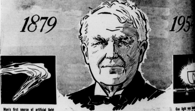
Man's first source of artificial light was the cave man's firebrand or pine torch.