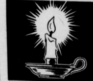
Tallow candles came into use during the Middle Ages and served as a source of light for centuries.