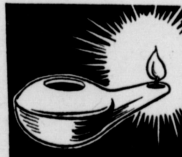
The oil lamp, using fish oil or animal fat with a moss wick, was known to the Phoenicians as early as 4,000 B. C.