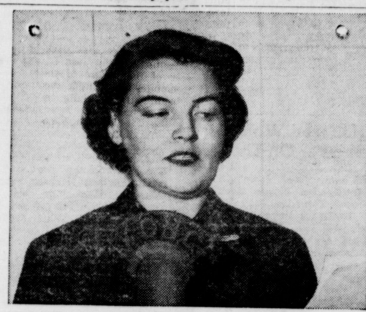
ular radio star of KGNC says, "Every best for cooking...and on the table...