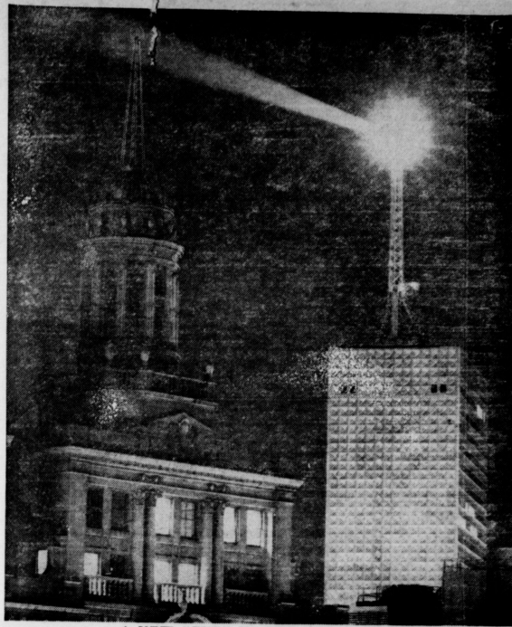
A NEW "EYE" IN THE TEXAS SKY

This spectacular night photograph shows the new half-billion candlepower beacon atop the new Republic National Bank Building in Dallas, Texas. Towering 150 feet above the roof of the building, 598 feet above the sidewalk, the light is visible 120 miles from Dallas. In the left foreground is the building now occupied by the Bank. Several blocks nearer the camera, it seems almost as high as the new structure. When completed, the tower supporting the beacon will be covered with more than two miles of brilliant luminous tubing, in changing colors of red, white and blue. Dedication of the $25,000,000, 40-story building is scheduled for December 1.