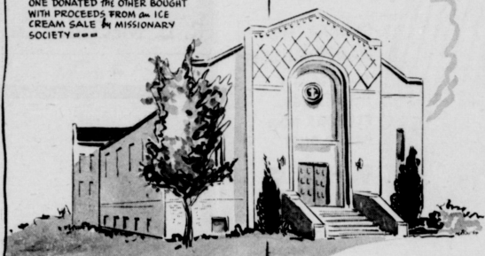
A TABERNACLE BUILT IN 1926 WAS DESTROYED in A WIND STORM