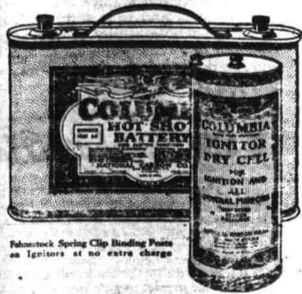
Fibertock Spring Clip Binding Points on Ignitors at no extra charge