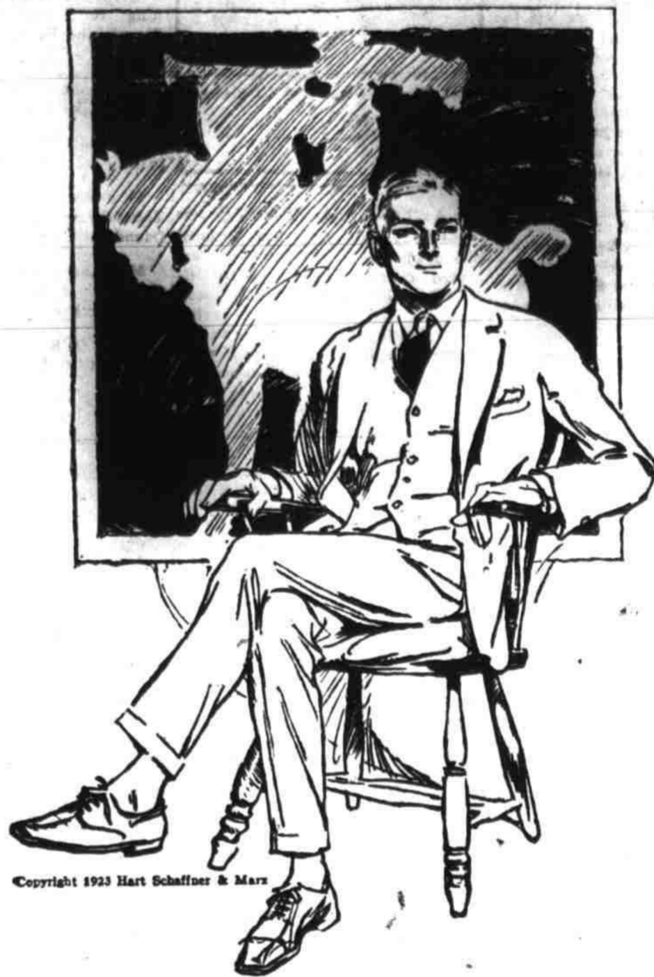
Copyright 1923 Hart Schaffner & Marx