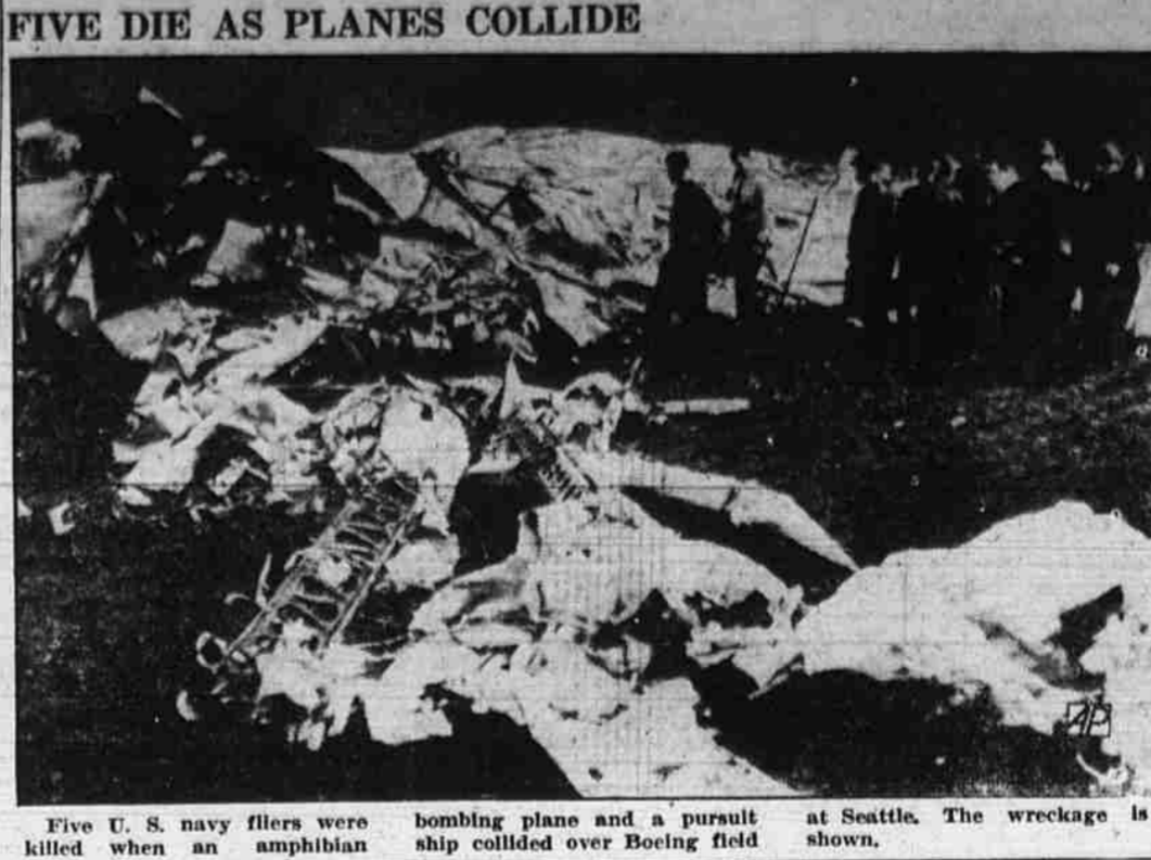
FIVE DIE AS PLANES COLLIDE Five U. S. navy fliers were killed when an amphibian bombing plane and a pursuit ship collided over Boeing field at Seattle. The wreckage is shown.

Women Form Symphony ST. LOUIS (UP)—Formation of an all-women's symphony orchestra has begun here. It will be composed of professional and amateur musicians, and will present several concerts each year.