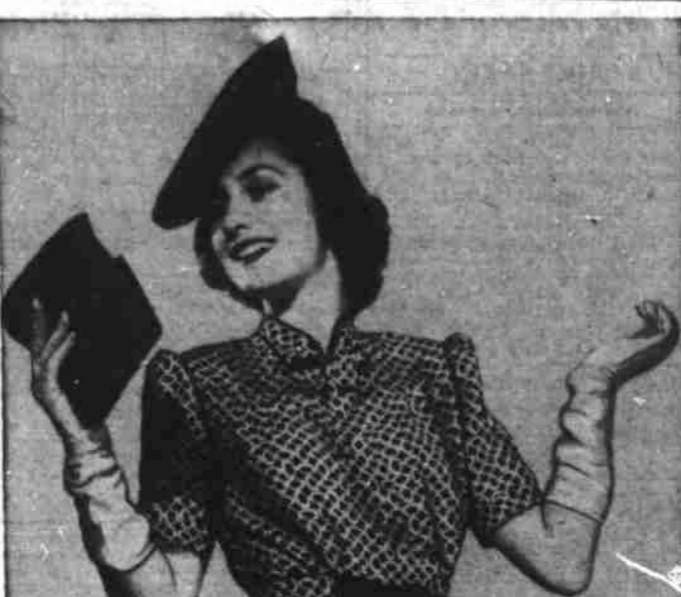
A 1940 VERSION—The shirtwaist dress—done this time with the season's softer look. It's made of silk crepe, printed in a neat blue and white pattern and finished with a belt buckle of navy blue leather.