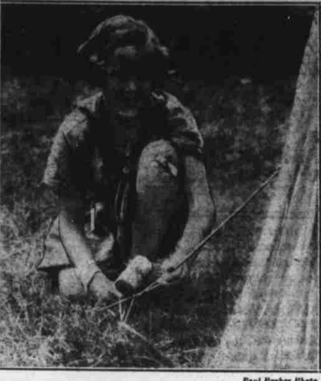
It takes more than a scratched knee to dampen the enthusiasm of a