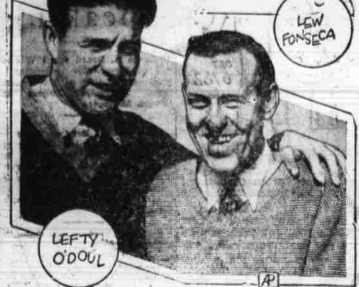
Move back the fences and buy up a few hundred extra baseballs—the two champion hitters of the big leagues last year are ready for the 1930 campaign. Frank 'Lefty' O'Doul of the Philadelphia Phillies, leading slapper of the National League, and Lew Fonseca, Cleveland's batting contribution to the American League, are both in condition and ready to repeat last year's performance.