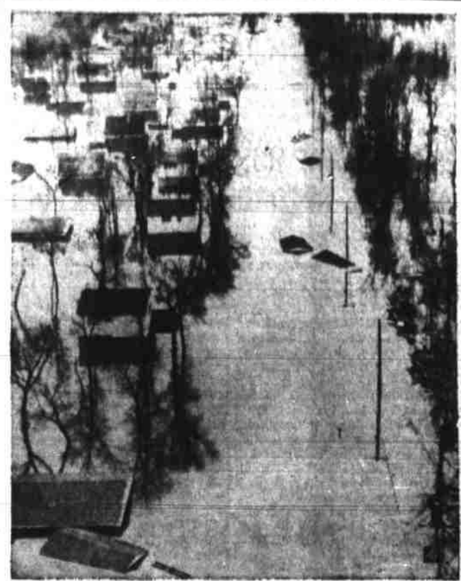
GARAGES FLOAT AWAY—In the Wildwood area of Winnipeg, Man., the strong Red River current is uprooting the garages and floating them down the streets. In addition to other hazards of the flood another has shown up. An oil slick is from the oil tanks of residential homes in the area who heat with oil. (AP Wirephoto).

WASHINGTON, May 22. (AP)—A North Carolina primary this week may show in more detail how southern Democratic voters feel about President Truman's "fair deal" program.