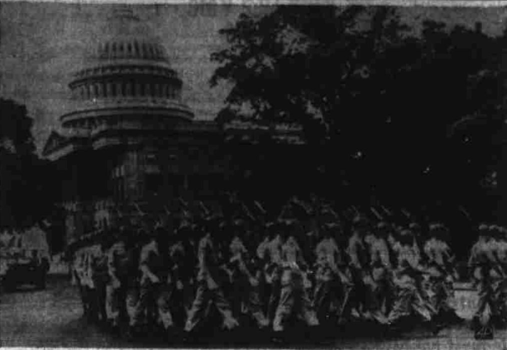
ARMED FORCES DAY PARADE—Troops from Fort Myer march past the U. S. Capitol in Washington in the first joint Armed Forces Day parade. Ten thousand marchers from the Army, Navy and Air Force participated in the joint display of military strength.