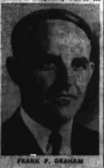
FRANK P. GRAHAM

BIG SPRING AND VICINITY: Partly cloudy this afternoon, tonight, and Tuesday. High 65, low 45. Wednesday: High 65, low 45. Thursday: High 65, low 45. Friday: High 65, low 45. Saturday: High 65, low 45.