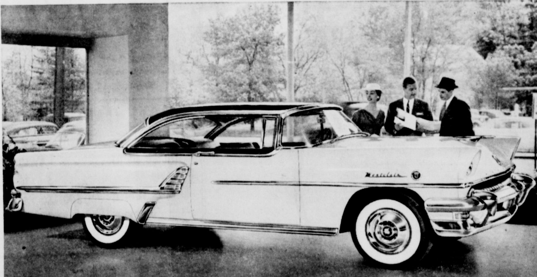
NO OTHER CAR OFFERS YOU BIGGER REASONS FOR BUYING IT. Mercury's styling is exclusive—shared by no other car. Every model offers you new SUPER-TORQUE performance (188-hp in Customs and Monterey, 198-hp in Montclairs). And Mercury consistently leads its field for resale value. Shown above, the Montclair hardtop Coupe. This same Montclair styling is also now available in a 4-door Sedan.