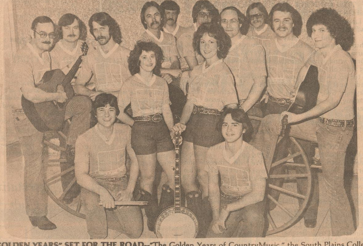
"GOLDEN YEARS" SET FOR THE ROAD--"The Golden Years of CountryMusic," the South Plains College

A meeting to plan the baseball program will be held tonight (Thursday) at 8:00 p.m. in the school cafeteria. All parents and volunteers are urged to attend this meeting. Any business wanting to sponsor a team or any individual wanting to volunteer their services are asked to contact one of the following officers of the Motley County