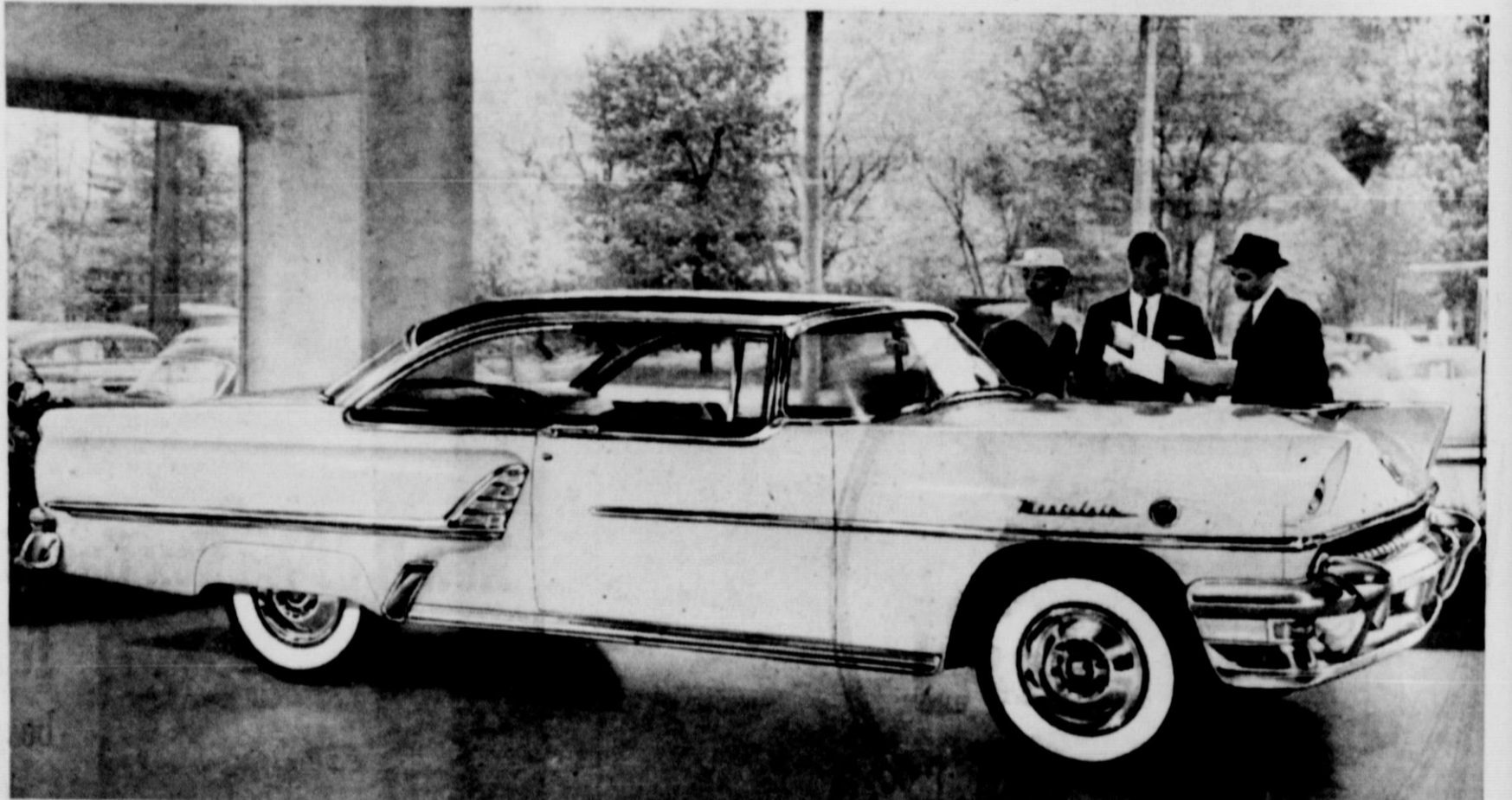
THE NEW 198-HORSEPOWER MONTCLAIR HARDTOP COUPE, shown above, is one of Mercury's 11 models, in 3 series. There is a Mercury priced to fit any budget.

As Mercury sales go up—your cash outlay goes down Don't miss the biggest summer savings yet!