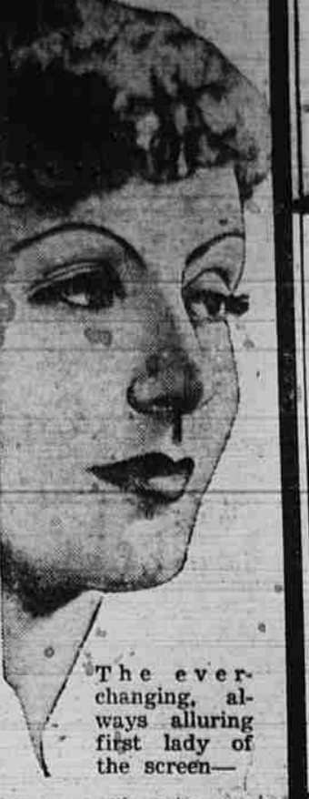
The ever-changing, always alluring first lady of the screen—

Public Records BUILDING PERMITS R. B. Davidson, to set two pumps at the south end of the Benton street viaduct, east of 310.