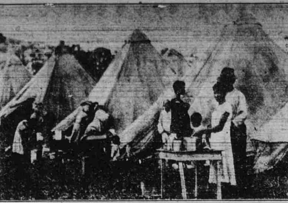
Many persons left homeless by the hurricane which swept Puerto Rico took temporary refuge in tents established by the national guard. This picture shows refugees living in tents near San Juan.

of town, it is said, is the feeling that county roads through the oil fields would be more permanently improved if the south precincts used all the road and bridge money they pay on their own property.