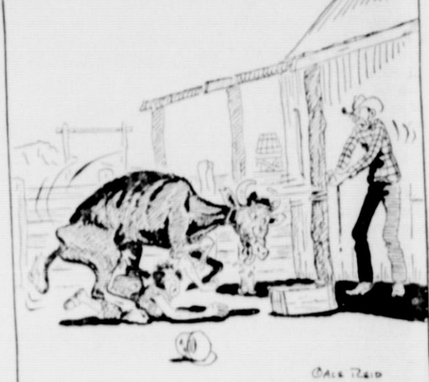
'Maw, quite excitin' that ole cow or she's gonna quite givin' This feature sponsored by THE FIRST STATE BANK