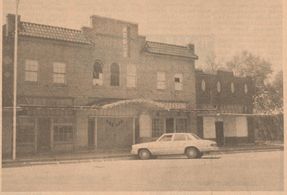
ON THE AUCTION BLOCK—The ever-familiar Rogue Theater building and the former City Bakery will be auctioned to the highest bidder on September 4th at the Motley County Courthouse. The theater was built in the early 1930's and showed movies until the late 1950's. The buildings are located on the center of Main Street across from the courthouse.

Read any good books lately. If you have been in the average book store you know good books are getting harder to find. Books such as "A Jew In-Love" are beginning to dominate the book shelves. In this book, by Ben Hecht, he says, "One of the finest things ever done by the mob was the Crucifixion of Christ. Intellectually it was a splendid gesture. But trust the mob to bungle. If I'd had charge of executing Christ, I'd have handled it differently. You see, what I'd have done was had him shipped to Rome and fed to the lions. They never could have made a Savior out of mincemeat.