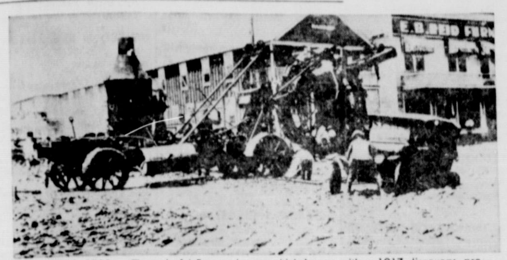
RANGER, 1919 — The colorful Ranger boom, which began with a 1917 discovery, produced some of the wildest boom town stories of them all; but this scene of an auto mired in its main street gives authenticity to reports of visitors paying to be "ferried" across