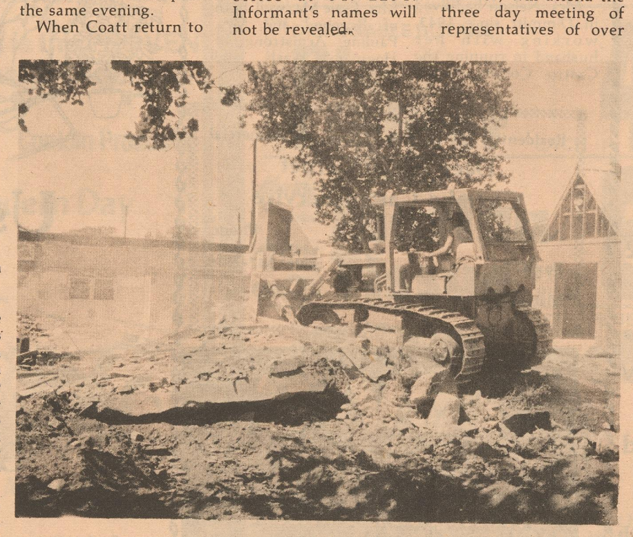
Governor's State Indus- LAST REMAINS -- The foundation and basement of the old Methodist Church in trial Board of Directors. Matador were pushed down Monday. Beside the old building stands the new church She made the trip by which will be dedicated soon. The roof of the old building caved in last year, ending plane from Lubbock its long existence as a house of the Lord.

If anyone remembers seeing anyone around the car or has seen suspicious characters, they are urged to call the Motley County Sheriff's office at 347-2234. Informant's names will not be revealed.