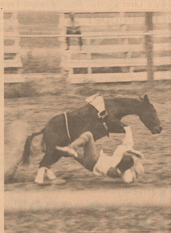
Hard Ride and hard fall for this youngster during the 1979 Motley County Jr. 4-H Rodeo held at Roaring Springs, July 15 and 16.

Members, parents, leaders and guests have received letters telling what they need to bring.