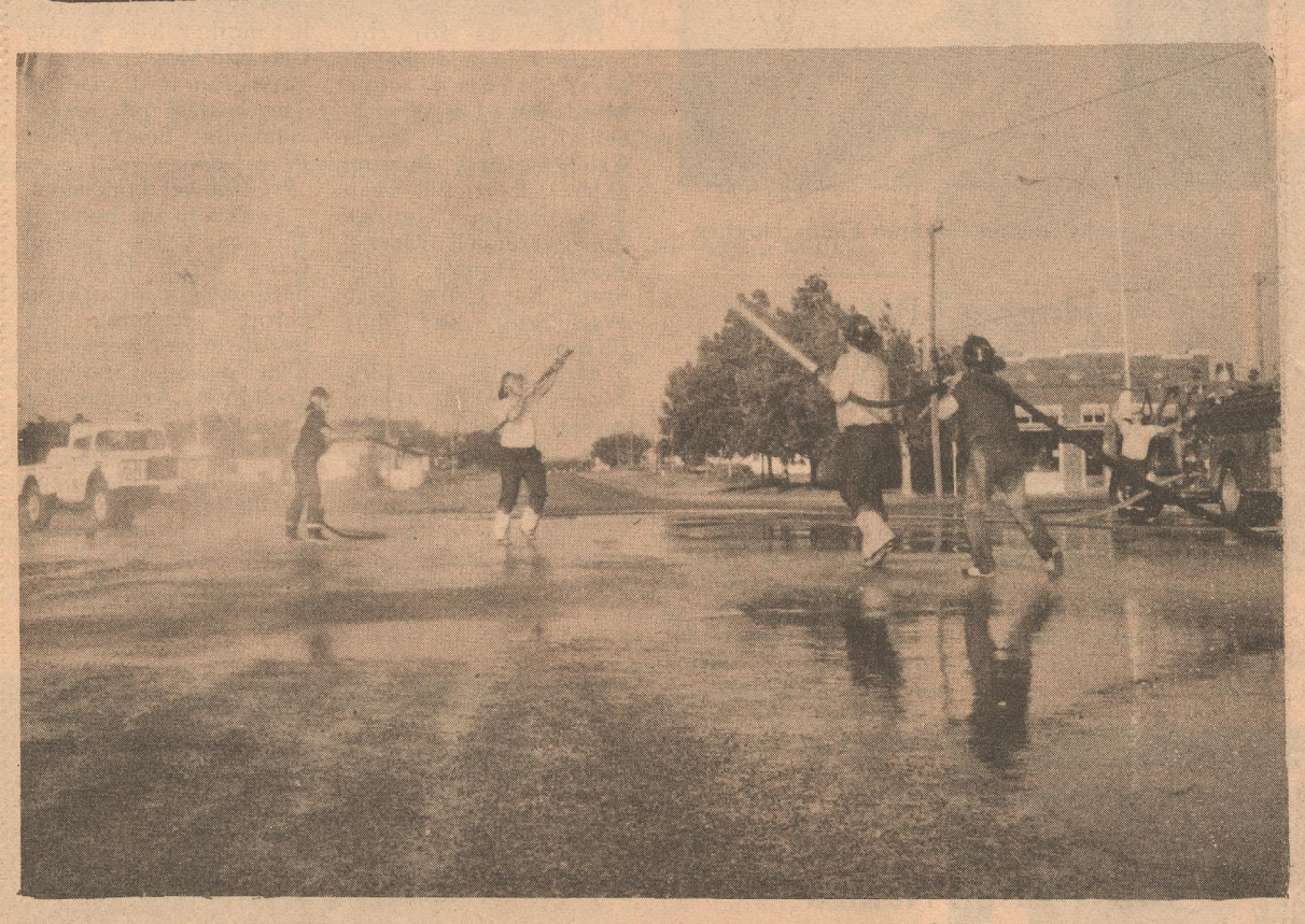
WATER POLO -- Members of the Matador Volunteer Fire Department add a little fun to their practice during hot summer months with a few games of water polo. other team back.