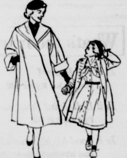
TAKE SISTER TO THE SCOUT MEETING - while your automatic washer does the laundry