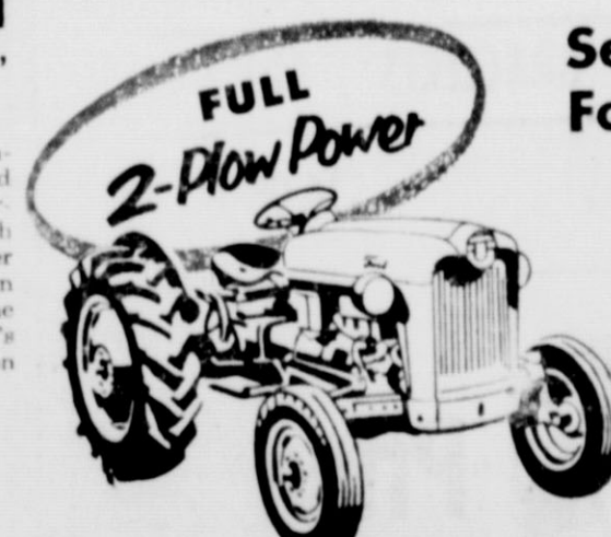
FULL 2-Plow Power

Here's a big reason for 800 Ford Tractors' performance-plus. They are powered by Ford's advanced "RED TIGER" engines ... fully 30% more powerful than any previous Ford Tractor engine. The high compression, short stroke design delivers more power on less fuel and with considerably less engine friction and wear. There are many advanced features in the new Ford "RED TIGER" engine, too. Only Ford's vast manufacturing resources and mass production efficiencies could bring you so much tractor engine at such a low cost!