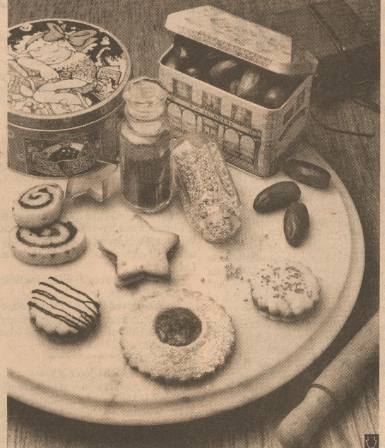
Festive California date-filled cookies make welcome holiday gifts.

Or water 1 tablespoon lemon juice Prepare dough: In mixer bowl, cream together butter, cheese, sugar, egg and vanilla. Sift together flour, baking powder, salt and nutmeg. Stir into creamed mixture with peel and almonds. Chill several hours or overnight. Prepare date filling: In saucepan, combine dates with juice or water. Bring to boil; reduce heat and simmer 5 minutes. Stir in lemon juice. Blend smooth in food processor or electric blender. Cool. Store in covered container in refrigerator up to 1 month. Makes about 2 cups. Assemble and bake cookies following one of the variations below. SANDWICH COOKIES: On well-floured surface, roll dough 1/8-inch thick. Cut into desired shapes with cookie cutters. Bake on ungreased baking sheet in 375 degree oven about 8 minutes, until edges are golden. Cool on racks. Sandwich