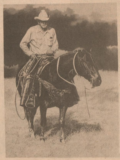
"75 Years Of The Best - PHD in 'Cowology'"