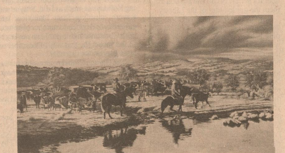
"Tracks in the Frost - Panther Canyon, Matador Ranch"

Everyone in Roaring Springs is invited to come by and enjoy refreshments on this special day.