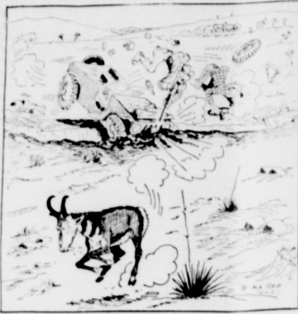
Hold'er steady jist a little longer. I've got a perfect bead on him!

This feature sponsored by THE FIRST STATE BANK