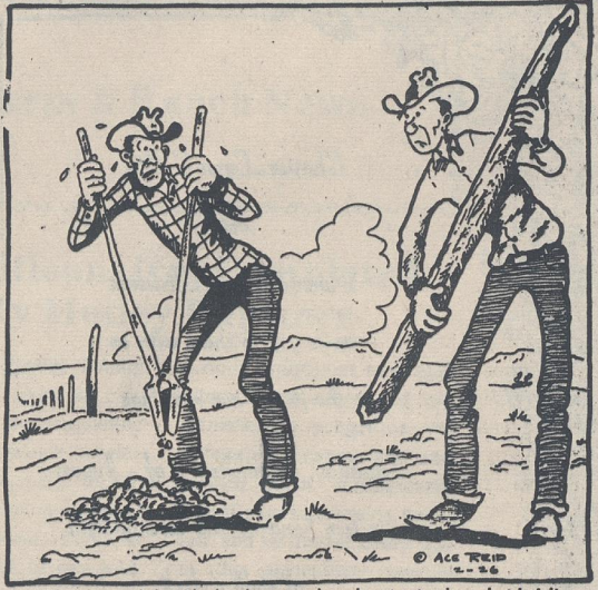
The boss said that I had to be a good cowboy to stay here, but I ain't