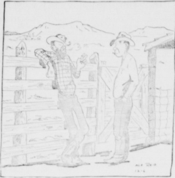
"Yep, I'm a successful rancher. I got a 40-year loan on my ranch. 3 years on my pickup, 90 days on my calves and there ain't no possible way of payin' off none of them."

This feature sponsored by THE FIRST STATE BANK