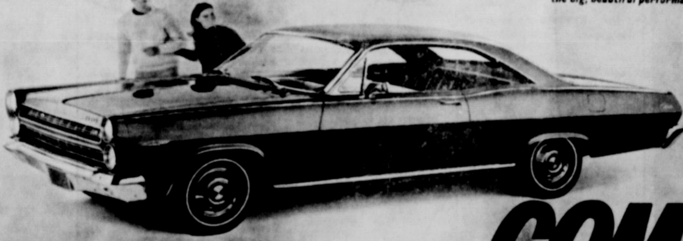
COMET CALIENTE 2-DOOR HARDTOP