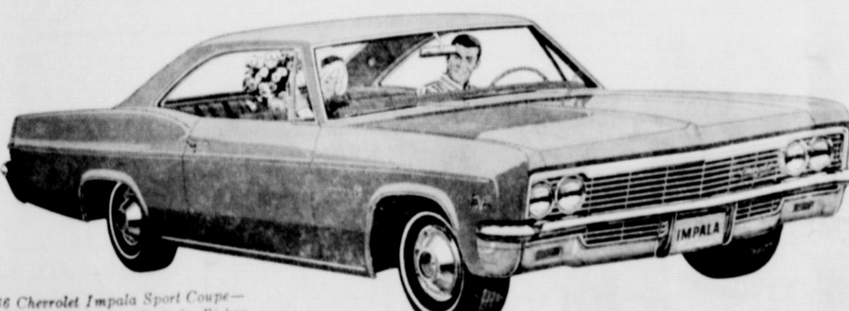
'66 Chevrolet Impala Sport Coupe— with crisp-lined new Body by Fisher