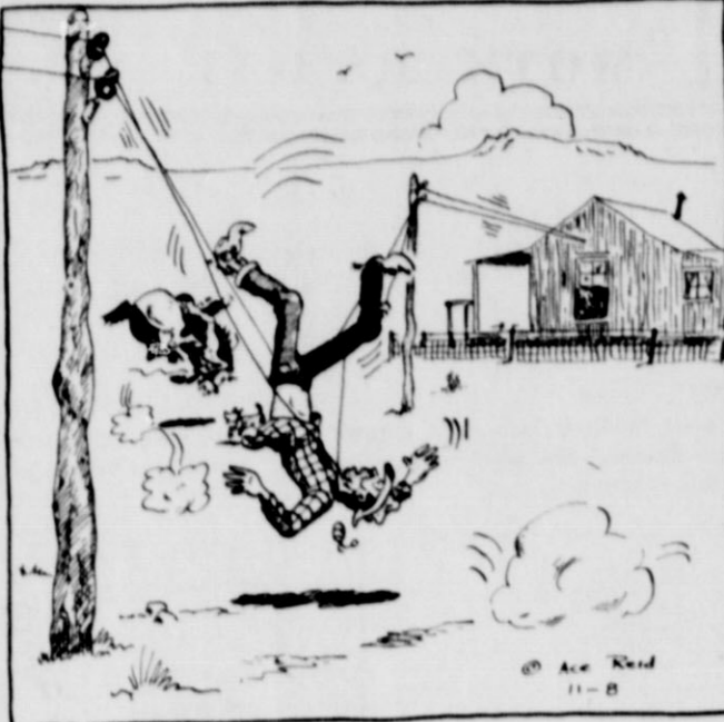
"Jake, git off the line . . . you're causin' an awful lot of static!"