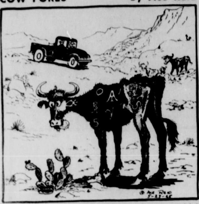
'They're a hardy breed all right or they couldn't survive that brandin'!"