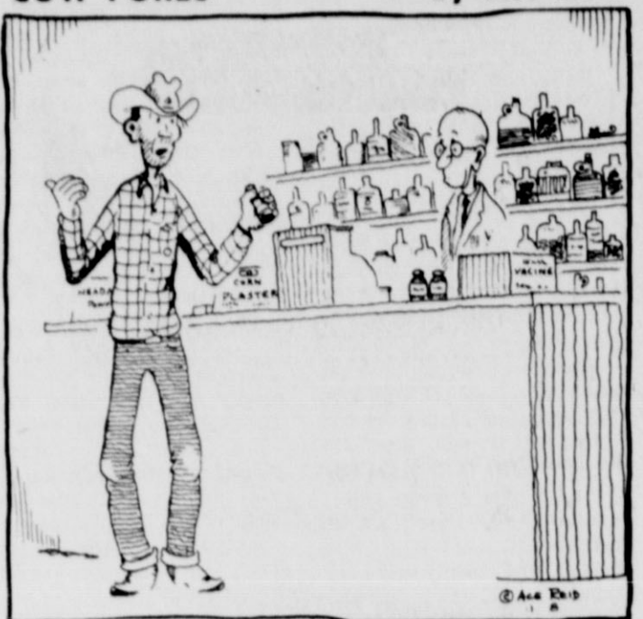
How in the world do you expect me to keep this vaccine at 52 degrees when it's 114 degrees outside!"

This feature sponsored by THE FIRST STATE BANK