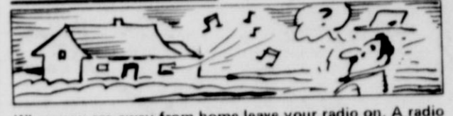
When you are away from home leave your radio on. A radio uses little electricity and gives the impression that your house is occupied.

attach to a large number and variety of input and output devices and can be used for many different types of requirements. Young children by the age of 2 need other children, not just to have fun, but to learn how to get along.