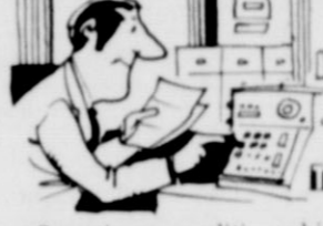
Sometimes, qualities which seem sophisticated to some people help many people run their lives and businesses in a more efficient way. One computer, for example, the Series-1 developed by IBM, is intended primarily for experienced data process users yet has 19-inch rack-mountable units that can