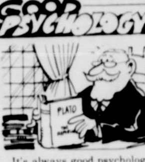
It's always good psychology to ask yourself, "How can this be done better?" That way you'll not only be improving whatever you're working on but you'll be improving yourself as well. And it's never too late to begin. At the age of 92, Justice Oliver Wendell Holmes read Plato to improve his mind.