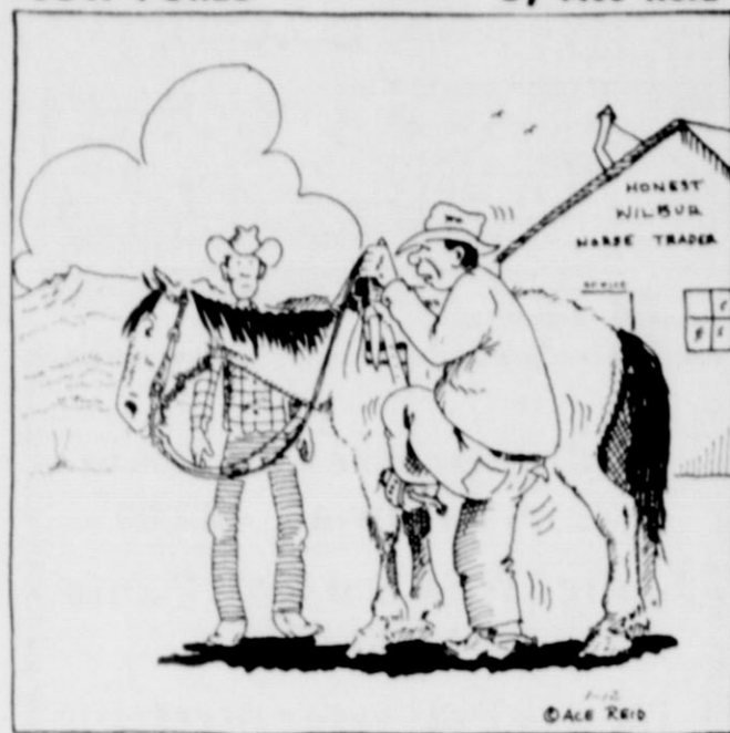
"Oh, I can ride 'em as good as ever . . . gittin' on 'em is my problem!"

THIS FEATURE SPONSORED BY FIRST STATE BANK