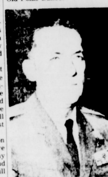
H. M. BAUMGARDNER MEMORIAL SPEAKER