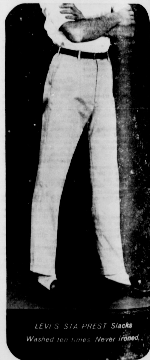
LEVI'S STA-PREST Slacks Washed ten times. Never ironed.

WASH 'EM ... in the home washer, at the coin laundry or on a scrub board. DRY 'EM ... on the clothes line or the automatic dryer, or on a bush. WEAR 'EM ... the crease will stay IN, the wrinkles will fall OUT, washing after washing, drying after drying and wearing after wearing.