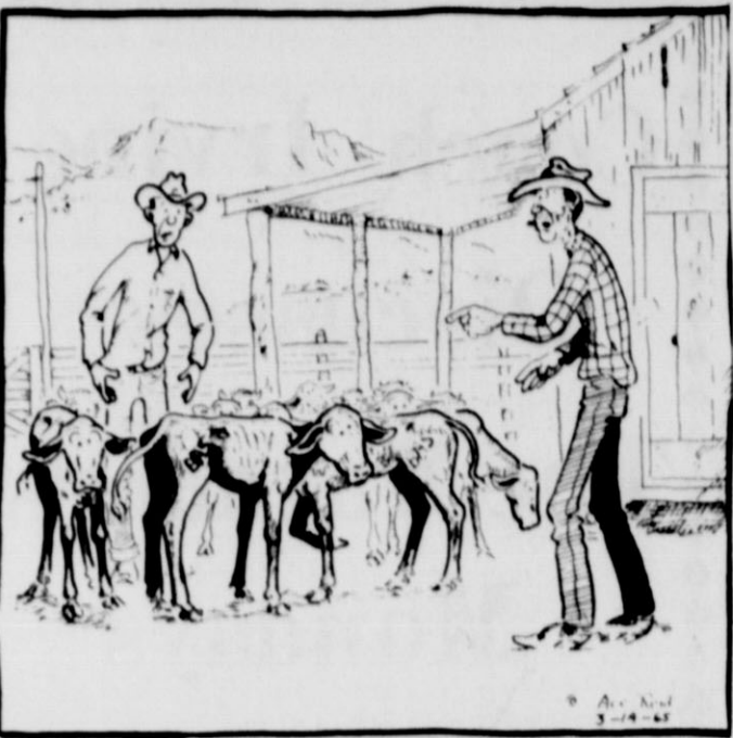
These calves ain't pore! They're bred slim so they can git thru cedar brakes without skinnin theirselves up!