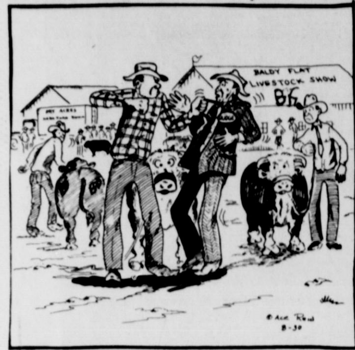
"Now, Mister, calm down, or people will think you are a poor loser!"