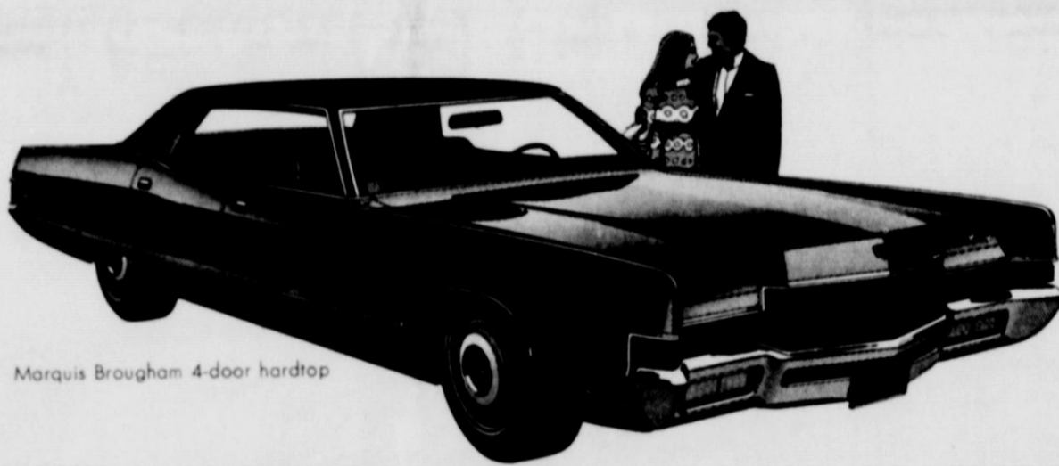
Marquis Brougham 4-door hardtop