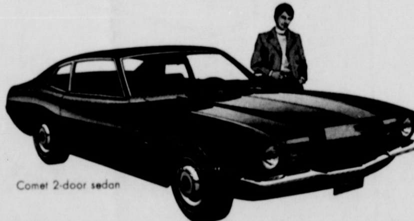
Comet 2-door sedan