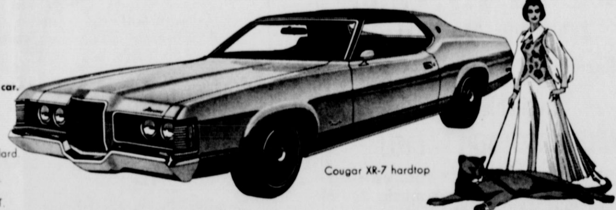
Cougar XR-7 hardtop