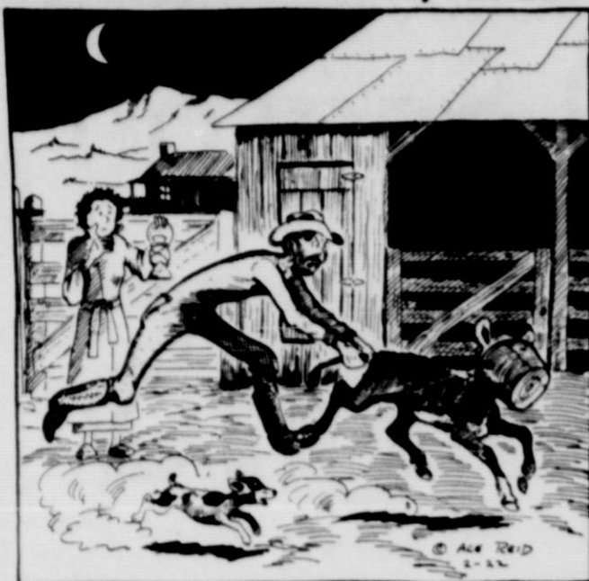
"Bellerin' all night! I jist wish you'd stuck your head in the feed grinder 'stead of a bucket!"

This feature sponsored by THE FIRST STATE BANK