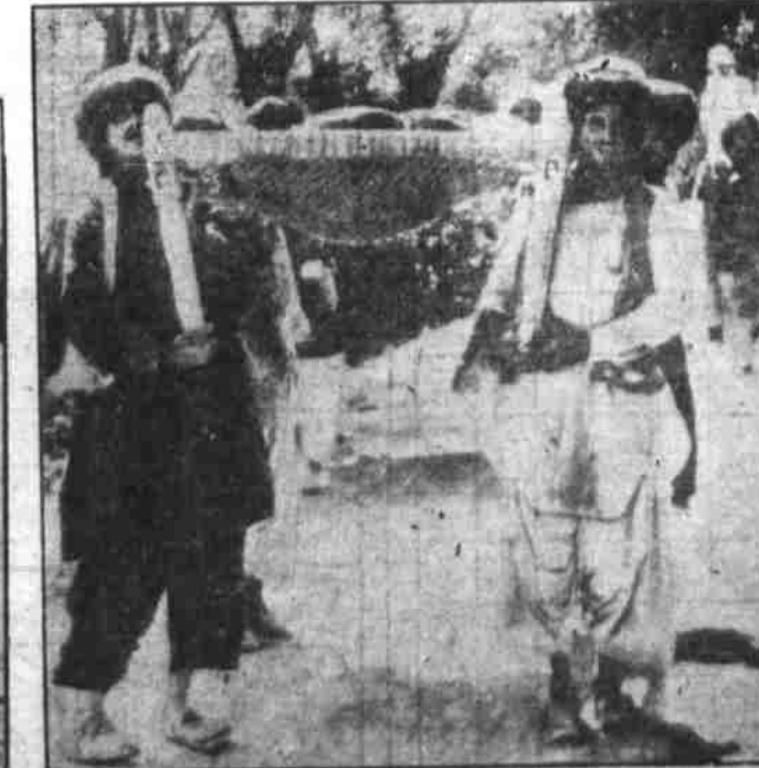
Searching for a safe place of habitation, natives in the quake-stricken area of Quetta, India, are shown carrying injured with them. It was estimated 26,000 persons perished in Quetta alone, and more than 40,000 in the entire district affected.