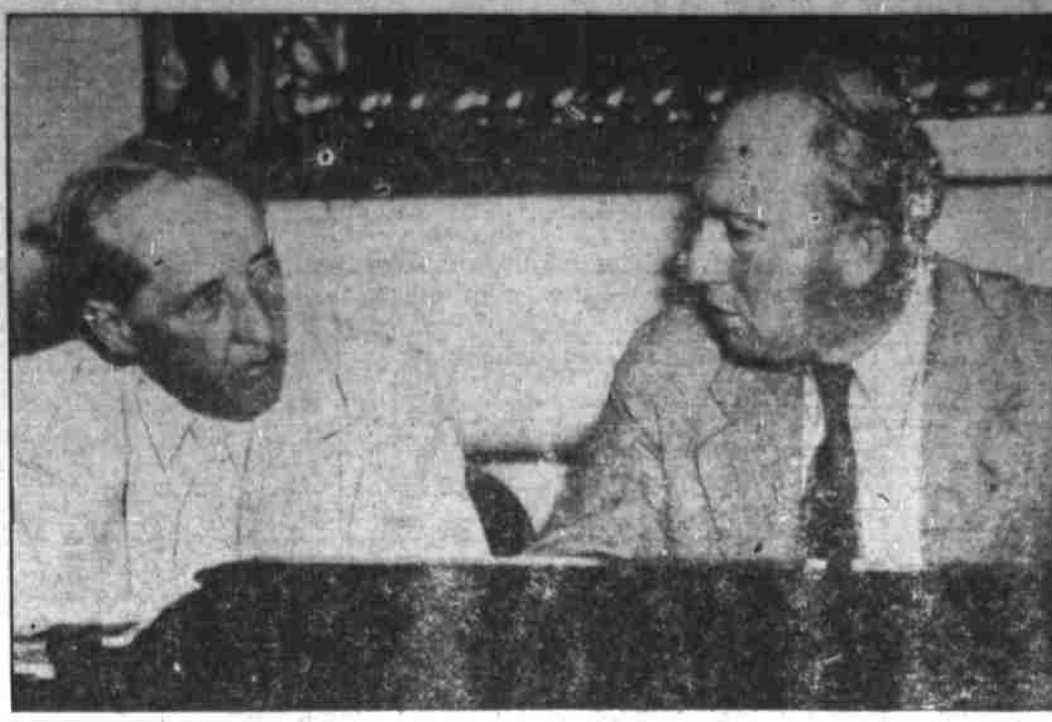
Senator King (D-Utah), at left, and Chairman Harrison (D-Miss) of the senate finance committee shown as they discussed the delay in committee action on the administration's "tax the rich" program. Doing experts asked more time to work out tentative rate schedules.