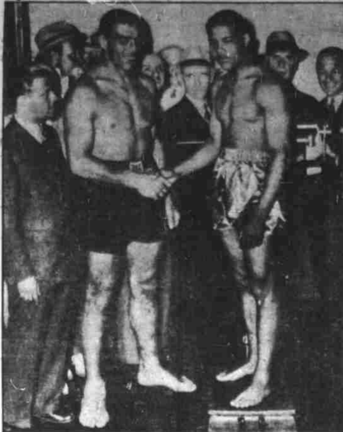
This was the rather tense meeting of Primo Carnera (left) giant Italian heavyweight, and Joe Louis, (on the scales) "the Detroit bomber," as they really sized each other up prior to their important engagement in the Yankee stadium, N. Y. Louis tipped 196; Carnera entered the ring at 260 1/2 pounds.