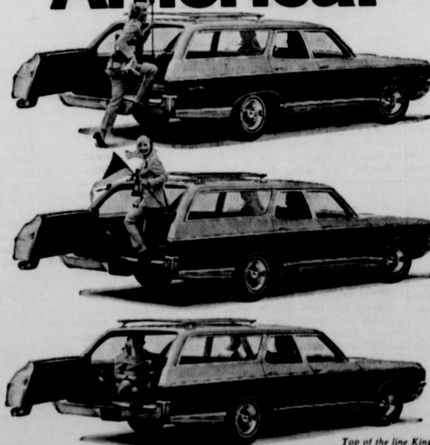
Top of the line Kingswood Estate Walk-in.

You'll have a hard time finding a wagon as easy to get into as a 1970 Chevrolet.