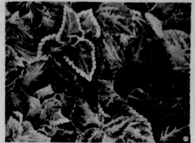
Planted 18 inches apart in a semi-shaded place where the soil has plenty of humus, coleus plants soon form a carpet of color. They need plenty of water to perform their best.

Delightful carpeting for any sunny or partly shaded area in your garden is the foliage plant named Coleus. It has flowers, too, but, while they are attractive little lavender blossoms in tall, slender spikes, they are only a minor reason for growing the plant.