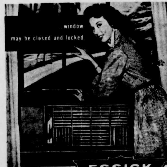
CAPRI MODEL - 4000 CFM

LEARN TO BUY CATTLE, HOGS AND SHEEP at sale barns, feed lots and ranches. We prefer to train men with livestock experience. For local interview, write age, phone, address & background to: NATIONAL MEAT PACKERS TRAINING 1805 East Ave Ft. Worth, Texas 76103 ATTN: Dept. WT-189