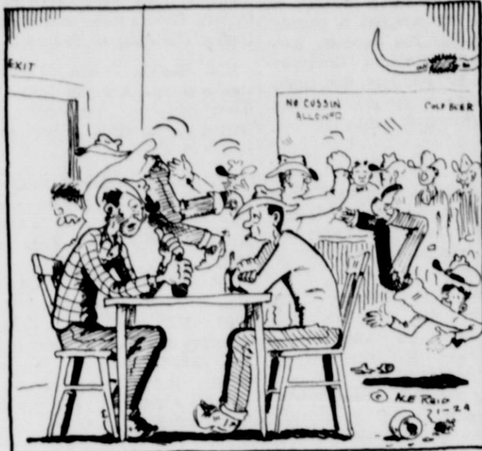
"These ole cowboys don't know too much about work, but they shore as heck know how to play!"

This feature sponsored by THE FIRST STATE BANK