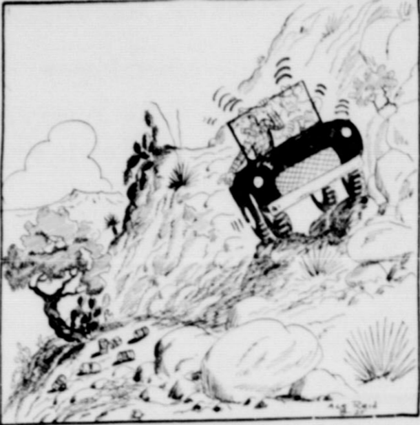
"Wul, if no white man ever set foot in this country, the prehistoric Indians were shore careless about their beer cans!"

This feature sponsored by THE FIRST STATE BANK