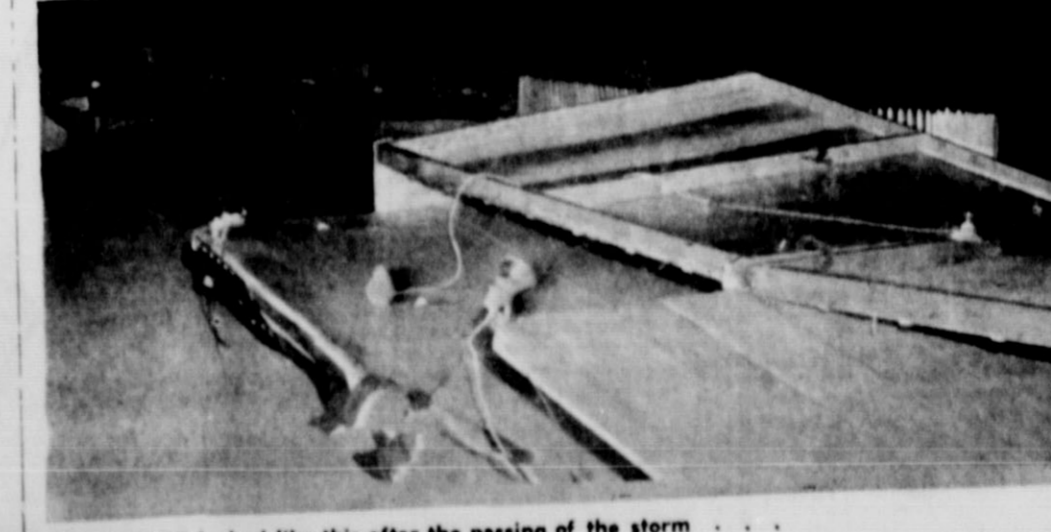
THE STAGE looked like this after the passing of the storm.