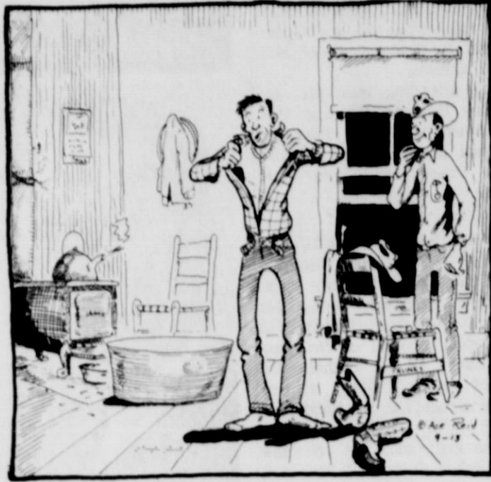
"Oh, gosh, no wonder it's been a hot summer, I forgot to take off my winter underwear!"

This feature sponsored by THE FIRST STATE BANK