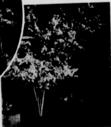
Permanent electric barbecue pit and lighted back yard

Electricity adds fun and extra hours to outdoor living