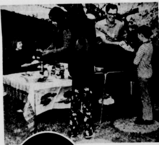
Portable electric grill