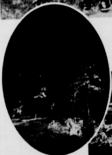
Lighted for beauty and outdoor living