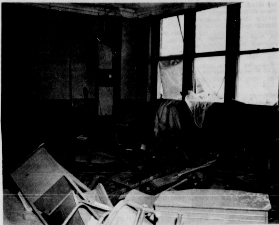
DAMAGE IN CLASSROOM at Dougherty Elementary School, May 12th, following an explosion, believed to have resulted from a natural gas leak. Nine children were treated for injuries, and two were seriously hurt. Window screens were blown fifty feet into the yard from the force of the explosion. There was no fire, according to authorities.