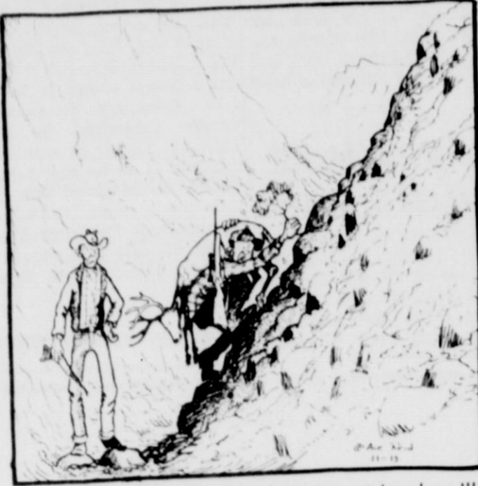
"Jake, on second thought, let's jist eat 'em here!"

This feature sponsored by THE FIRST STATE BANK