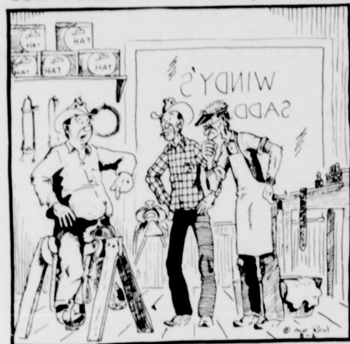
'Jist when are you saddle makers gonna git smart enough to make a saddle that won't rub blisters on a feller's belly?"

This feature sponsored by THE FIRST STATE BANK