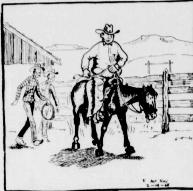
"This outfit has gotta git some stouter hosses or lighter cowboys!"

This feature sponsored by THE FIRST STATE BANK