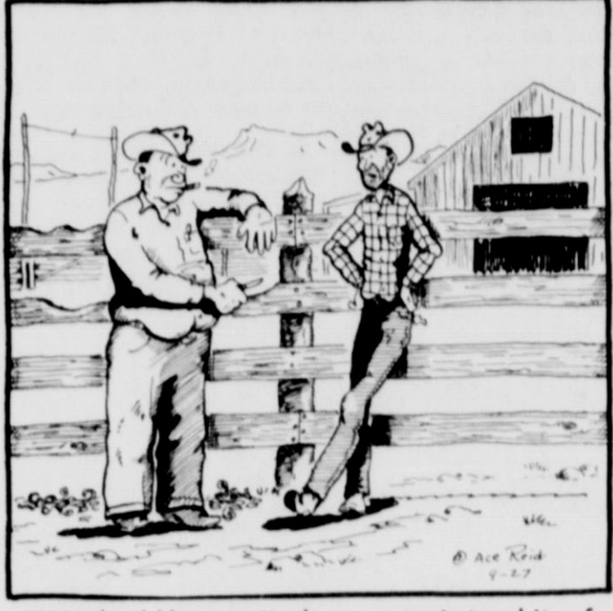
"We should have guit when we wuz in two bits of tradin. Now you've wore out a $4.00 knife and whittled up $15.00 worth of my fence."

This feature sponsored by THE FIRST STATE BANK