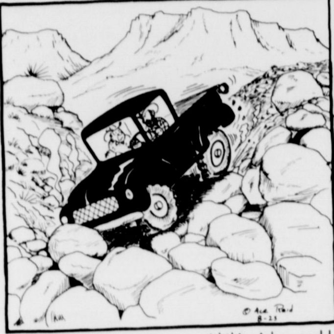
"That dang lyn car salesman said this pickup could go anywhere!"

This feature sponsored by THE FIRST STATE BANK