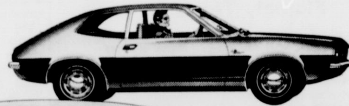
Pinto 2-Door Sedan