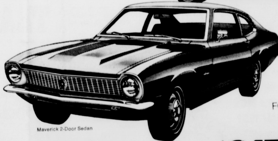
Maverick 2-Door Sedan

$1919* Pinto 2 door $66* less than VW 113