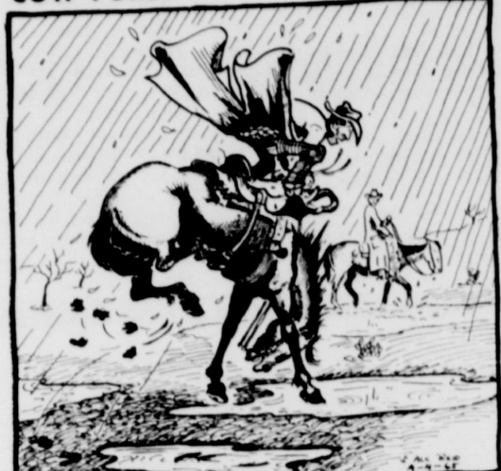
"Dang slicker! Without it I git pneumonia! With it I git killed!"

This feature sponsored by THE FIRST STATE BANK