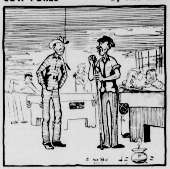
"Naw, I ain't had a job fer two years, and naw, I don't want one diggin' post holes and fixin' windmills."

This feature sponsored by THE FIRST STATE BANK